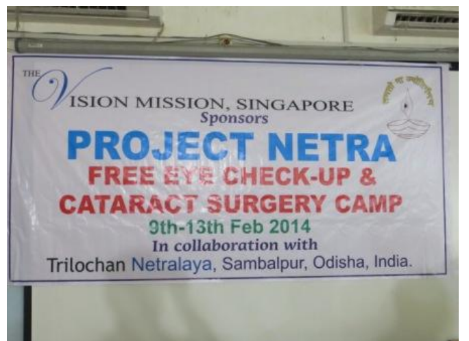
At the entrance to the camp