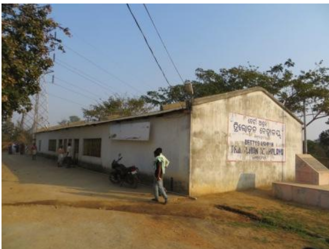
Betty's Ashram in Sambalpur