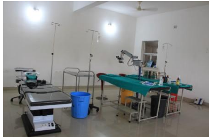
Operating Theatre at the camp