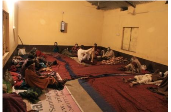
Peri-operative lodging facilities at the camp